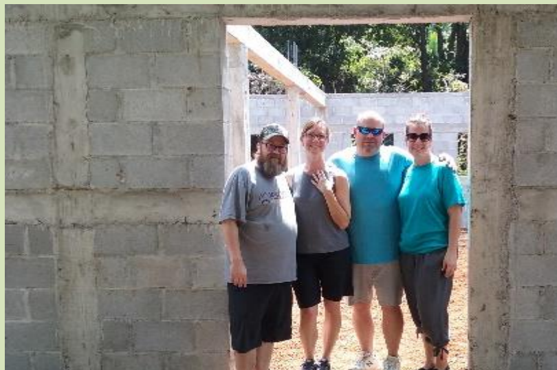
A few of the Recycled Lives' board members made a visit to the clinic & activity center construction site. March 2016, San Gabriel community, Guatemala.